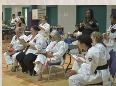
TYKI Instructors Judging