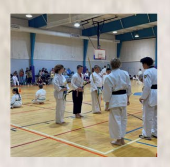
Younger Black Belts getting experience